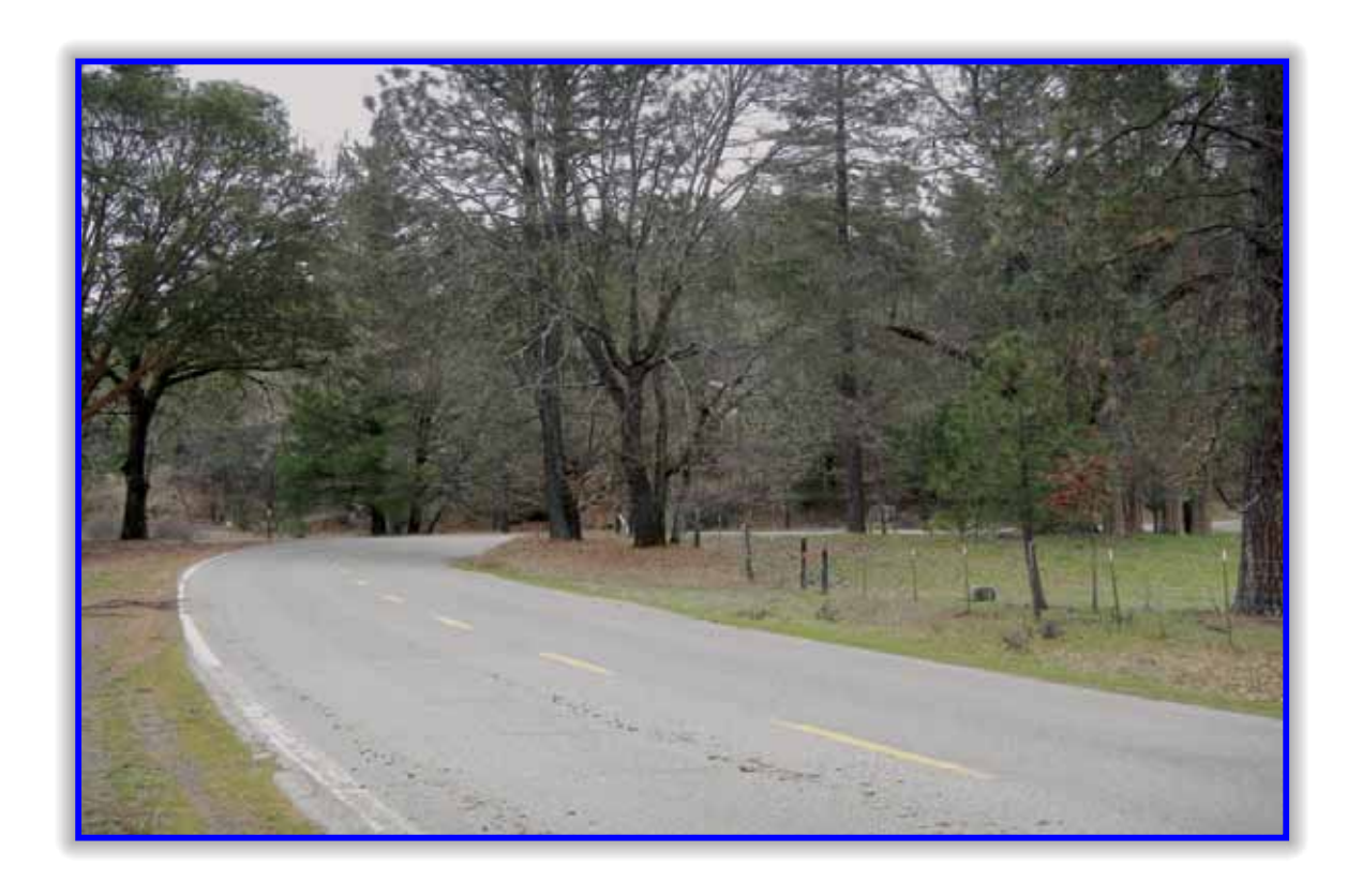
Travelers on Hyampom Road welcomed the transformation.

Recent Hyampom fuels reduction efforts focused on creating a fuel break along the roads into the community. Highly flammable brush and small trees were removed to a distance of 60 to 100 feet from the center of the road. The effort was all volunteer, led by the Hyampom Volunteer Fire Department and was accomplished by some very dedicated community volunteers. Work was done on Hyampom Road, Lower South Fork Road Pelletreau Ridge Road and Corral Bottom Road for a total of 30 acres treated. This effort was funded by a California Fire Safe Council (CFSC) grant, a first for Hyampom. The CFSC grant manager and Trinity County Resource Conservation District provided guidance in planning the project. The grant will help Hyampom Volunteer Fire Department obtain future needed fire fighting equipment.