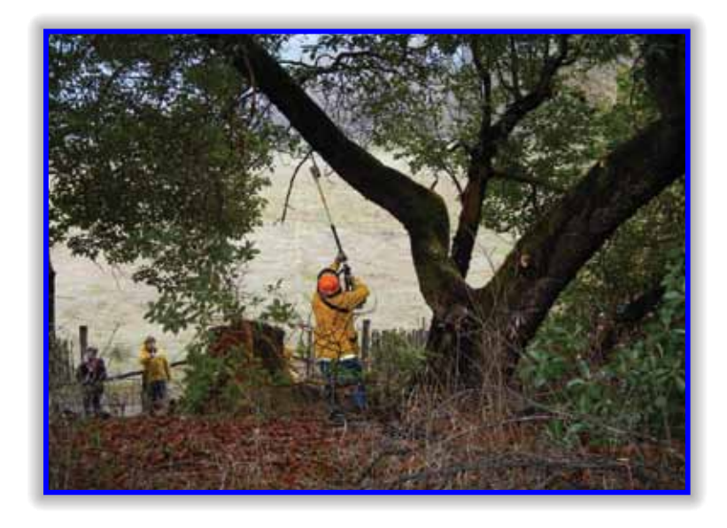
Cutting out dead branches reduces risk of fire spreading.