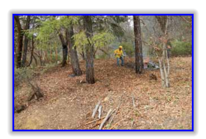
Tending to a burn pile.