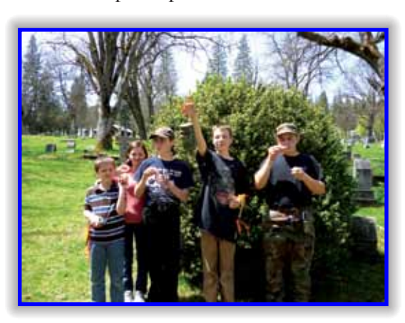
A GPS device helped lead this group to a cache of prizes.