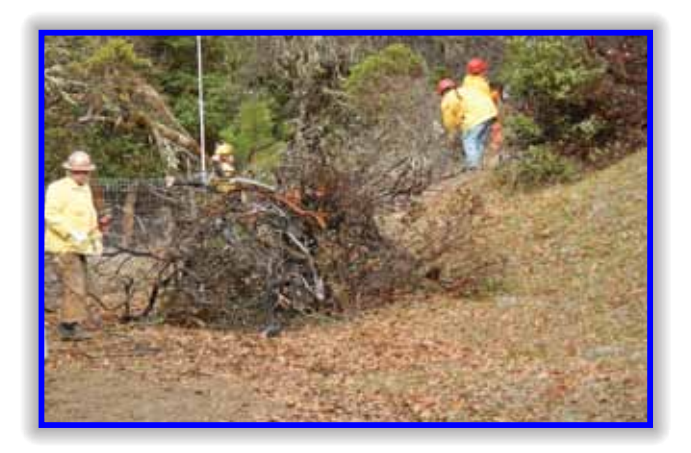
Stacking cut Manzanita into safe burn piles