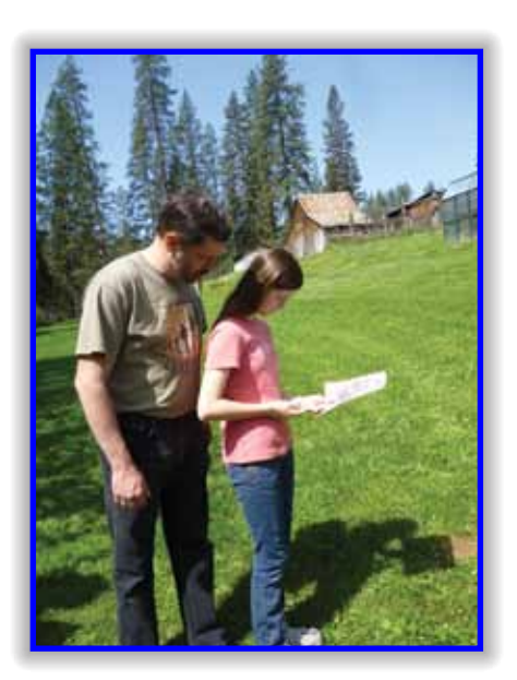
Participants use a compass to correctly orient their map to the landscape.