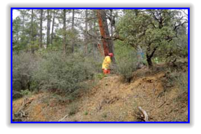
Cutting and dragging flammable brush.