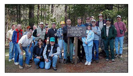
Community Members Supporting Trails

I have been impressed with the spirit of cooperation that exists in Trinity County. The Trinity County Fire Safe Council is a great example. A wide range of interests; from the Volunteer Fire Chiefs to the Association of Realtors, meet every month to work towards common goals – reducing the risk of severe wildfires and improving the health of our forests.