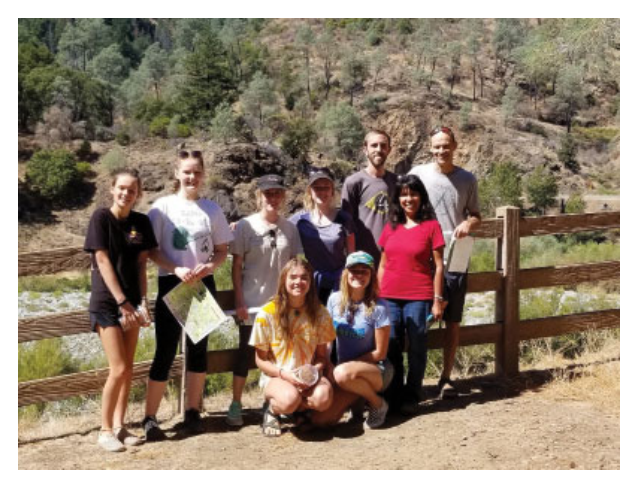
Shasta College Geo Adventure Club