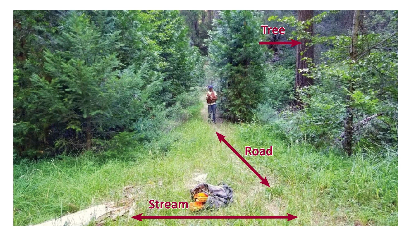
Before and after of culvert removal during road decommissioning

completed in early August 2019. The road decommissioning project included the removal of a 60" culvert from a perennial stream crossing to encourage the stream's natural flow.