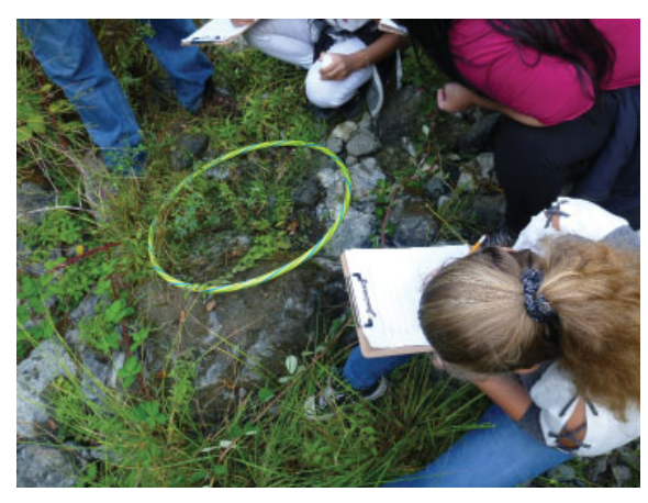
Students discovered biodiversity within hula hoop quadrats

annual migrations through salmon dissection, artwork, and games. This opportunity was made possible with support from the Trinity River Restoration Program and Trinity Preparatory School, in partnership with Hayfork Elementary School, AmeriCorps' Watershed Stewardship Project, and individual volunteers.