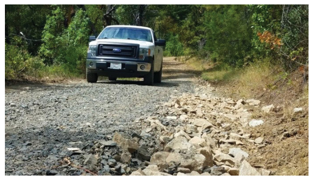
Before and after Gates Road improvement

rocked dips were created to divert water away from the road to prevent further damage and rock base was added to treat the eroded road surface. This project was made possible with funding from the Trinity River Restoration Program.