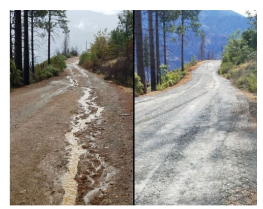
Photo 1: Before and after of road rock surfacing on Hocker Meadow Road

The District completed a large project on Hocker Meadow Road (Forest Road No. 33N41) this summer, which included resurfacing over a mile of road, and installed 13 rocked rolling dips to drain water off of the road surface (Photo 1). On Forest Road 33N41A, concrete cloth was applied to repair the bottom of a rusted culvert since the perennial stream was running underneath the culvert instead of through it.