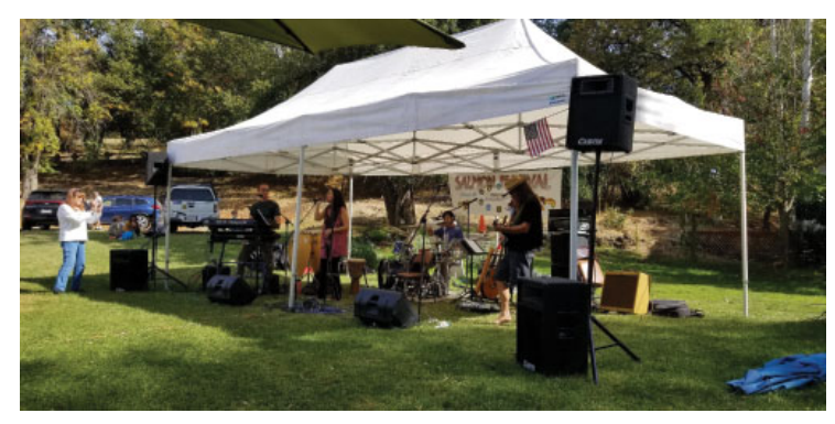
Live music by Philosopher's Tone