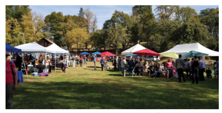
Salmon enthusiasts gathered at the festival