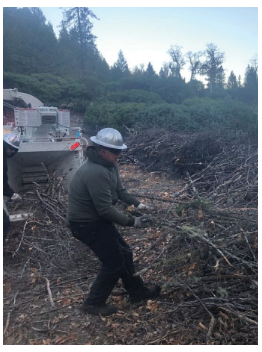
Putting the District's new chipper to work in Mad River