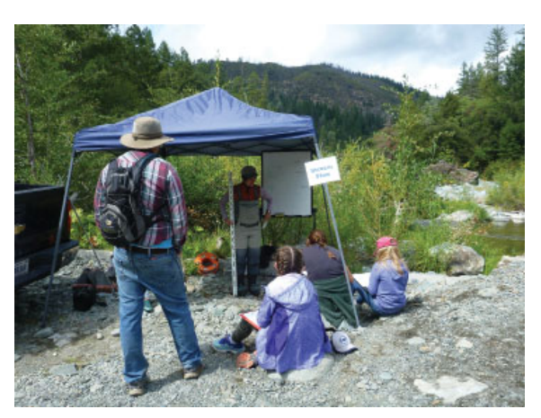
Students learned how river streamflow is measured