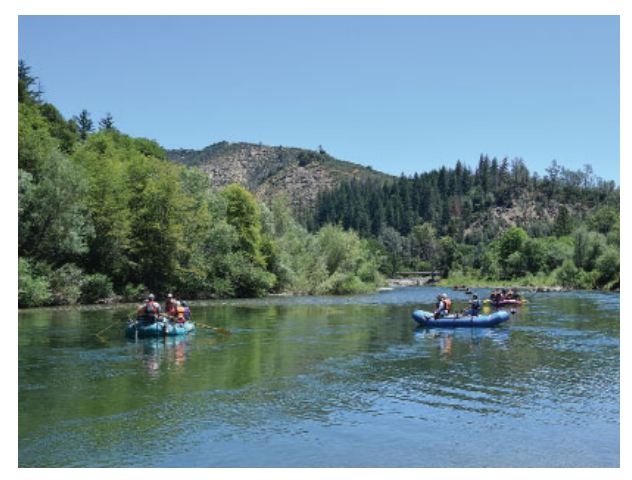
Learning about the Trinity River and having fun

Each year, members of the community are invited to float the Trinity River to learn about river health and management with staff from the Trinity River Restoration Program (TRRP). These float trips focus on increasing public awareness of TRRP restoration projects, and provide an opportunity to highlight project successes and lessons learned. This year