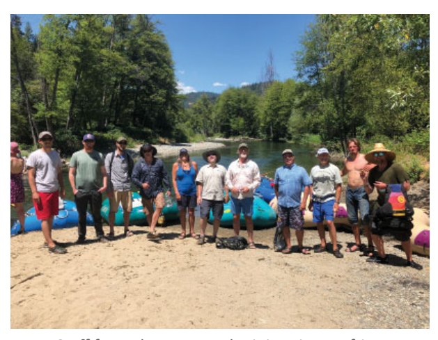
Staff from the TRRP and Trinity River Rafting

approximately 50 people attended the Trinity River float trips held on July 12 and 18, 2019 in Junction City and Douglas City. Trinity River Rafting outfitted and guided the float trip. This annual event is free and includes a healthy lunch along the beautiful Trinity River. Space is limited so it is recommended to sign up in the spring when the event is first advertised.