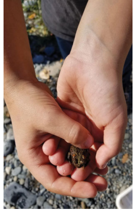
Finding friends outside