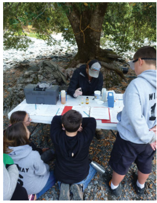
Field testing water samples revealed the water quality of Hayfork Creek

annual migrations through salmon dissection, artwork, and games. This opportunity was made possible with support from the Trinity River Restoration Program and Trinity Preparatory School, in partnership with Hayfork Elementary School, AmeriCorps' Watershed Stewardship Project, and individual volunteers.