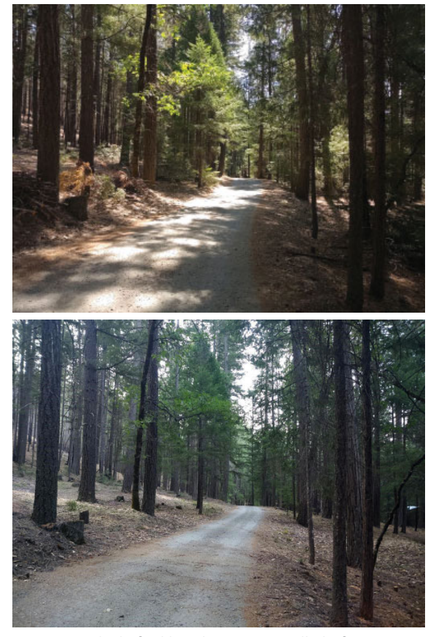
Roadside fuel break in Weaverville before and after Treatment

Fuel reduction projects in Junction City under both grants began in April, and as of September 2019 the fuel crews completed over 12 miles of roadside fuel breaks and treated 86 acres for hazardous fuels. In 2020 and 2021 these grants will support more hazardous fuel treatments in Junction City, as well as in Weaverville, Lewiston, and Douglas City.