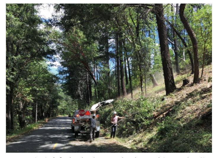
District's fuel reduction crew hard at work in Junction City