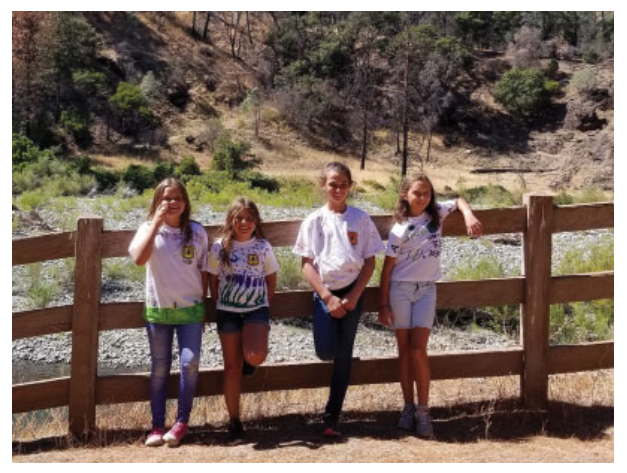
Girl Scouts Troop #70373

possible without the support and partnership of: community members, Girl Scouts Troop #70373, Shasta College Geo Adventure Club, Trinity River Rafting, CalTrans District 2, the Bureau of Land Management, the Trinity River Restoration Program, and the US Forest Service. The event concludes with a barbecue for volunteers, made possible by the generous meat and bun donations from Holiday Market. A huge thank you to everyone involved in this event. We hope you will join us again next year for the 4th annual Trinity River Clean-Up!