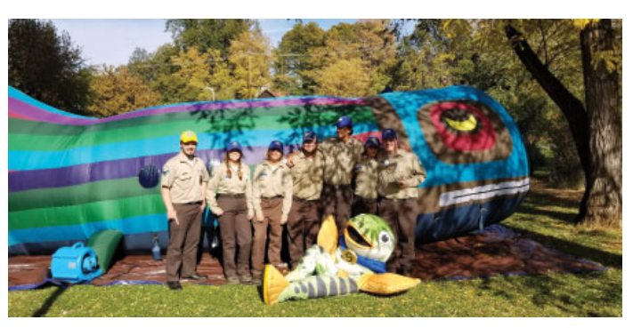
Thank you California Conservation Corps!

Restoration Program who sponsored this event, and Sierra Pacific Industries for providing the entertainment. This would not have been possible without the collaboration between Trinity County Resource Conservation District, Trinity County Visitor Center, and Trinity County Arts Council. A special thank you to the California Conservation Corps members for all of their help setting up this event! This year marked the 21st anniversary of the Trinity River Salmon Festival. This event coincides with Super Saturday in Weaverville which fills downtown Weaverville with exciting festivities including Trinity County Artists in Action, and the annual Dutch Oven Cook Off at the Jake Jackson Museum.