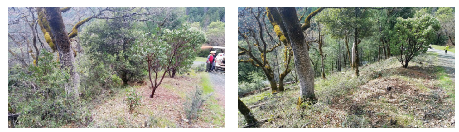
Roadside fuel break in Junction City before and after treatment