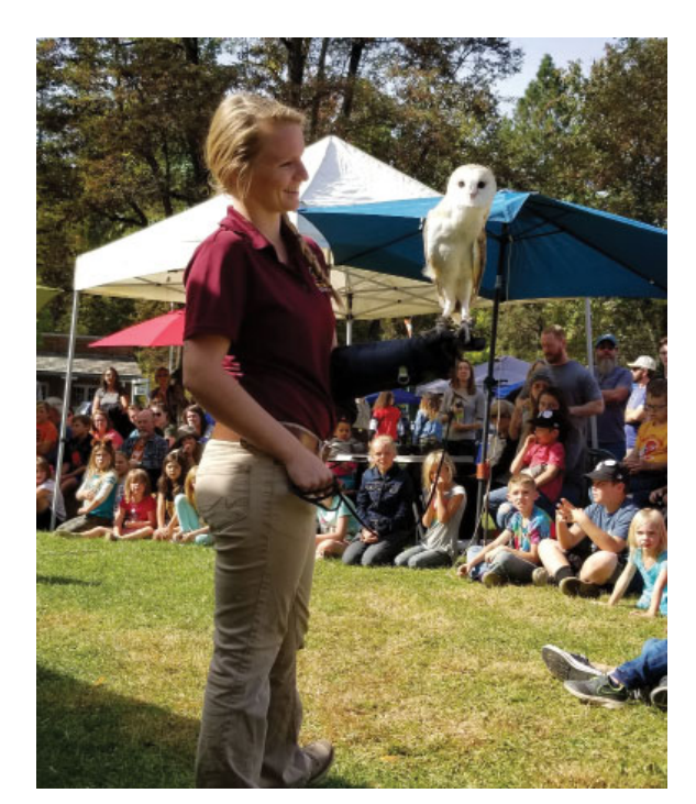
Special animal show from Turtle Bay Exploration Park