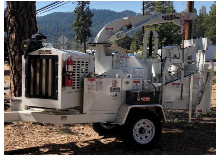
Able to increase hazardous fuel treatments with the new chipper