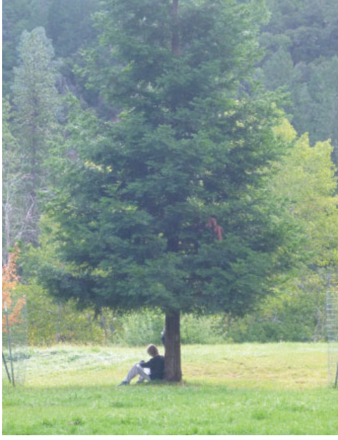
Student immersed in nature through journaling

The District offered Environmental Camp for 6th grade students from Weaverville and Hayfork Elementary Schools on September 18 and 19 at Bar 717 Ranch in Hyampom. Approximately 60 students spent 2 days in an outdoor classroom learning about archery, nature journaling, water quality, measuring streamflow, biodiversity, aquatic macroinvertebrates, as well as the salmon life cycle and