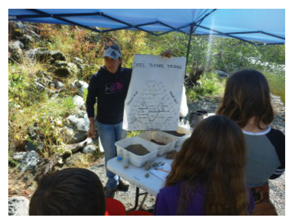
It's soil ... not dirt!