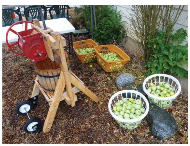
The apple press used at the Apple Festival.

Contact the District if you would like to volunteer at the YFR or TCRCD native plant nursery, to donate, to rent the facility, or for more information.