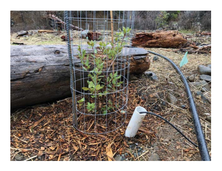
Canyon Live Oak planted at West Weaver Creek Channel and Floodplain Rehabilitation Project.

In total the District revegetated 5.17 acres with 1,117 native trees and shrubs.