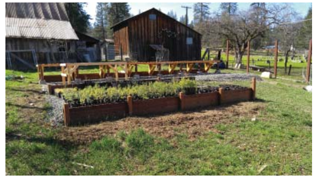
New construction of the Trinity County RCD's native plant nursery.

Work that the District completed in 2017 at the YFR included mowing and weed control of the grounds, repairs of infrastructure and equipment, maintenance of the old ranch house, scheduling events, and on-going planning and coordinating of tasks.