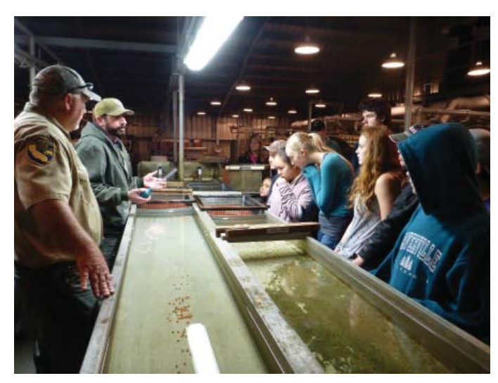
Lewiston students on a tour of the Trinity River hatchery, fall 2017.

During 2017 the District received funding and assistance for conservation education and outreach from Trinity River Restoration Program (TRRP), US Forest Service, Young Family Ranch Trust, Natural Resources Conservation Service, Bureau of Land Management, Redding Rancheria, California Fire Safe Council, Trinity Trust, UC Cooperative Extension, Watershed Research and Training Center, and individual contributors.