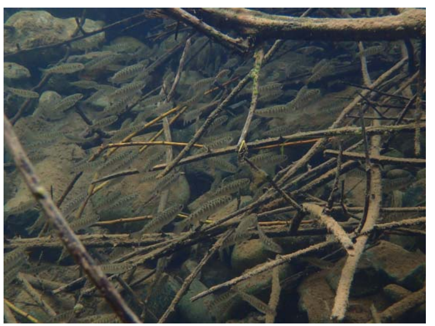
Figure 4. Juvenile Chinook salmon observed spring 2018 at a logjam feature constructed at the Deep Gulch site in 2017.