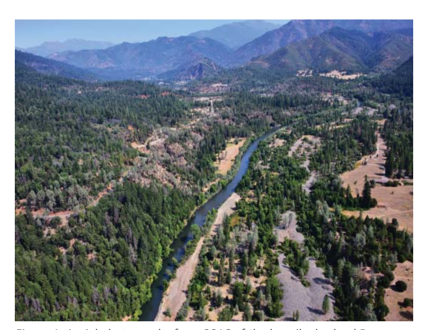
Figure 1. Aerial photography from 2016 of the heavily dredged Deep Gulch and Sheridan Creek project before 2017 construction. The narrow and fast moving channel had limited habitat for rearing young fish successfully.

In 2017, the 177-acre Deep Gulch and Sheridan Creek habitat restoration project upstream of Junction City was the latest channel rehabilitation project completed through TRRP (Figure 1). Channel rehabilitation projects are one method used to recover from the damage caused by over a century of mining and logging. Water diversions that eliminated the