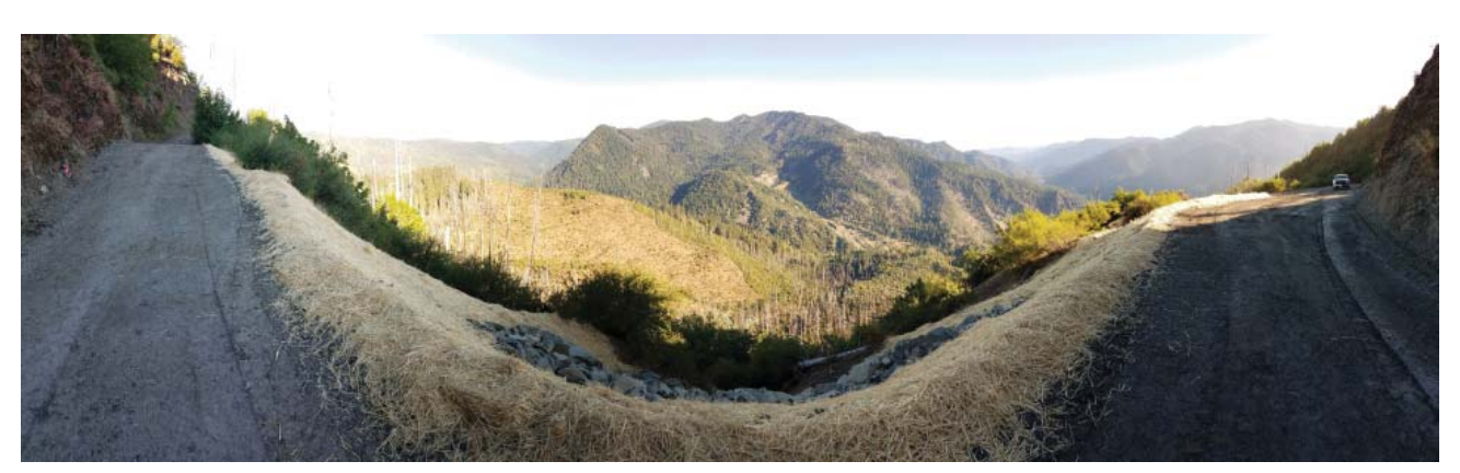
Sims Fire landslide stabilizing on 4N31 in Grouse Creek Watershed, South Fork Trinity Rver.

downstream to Silver Creek on the east flank of the South Fork of the Trinity River. Work included brushing roads, clearing logs, clearing culvert inlets, and installing road signs. Several of these roads had been impassable to the public due to brush or trees blocking the roads. The District also decommissioned four roads identified by the USFS for such treatment; three of these roads were in the Trinity Lake area and one was in the Dark Canyon Watershed of the South Fork of the Trinity River. This work was funded by the USFS, Trinity County Resource Advisory committee (USFS) and the California Off-Highway Vehicle Commission.