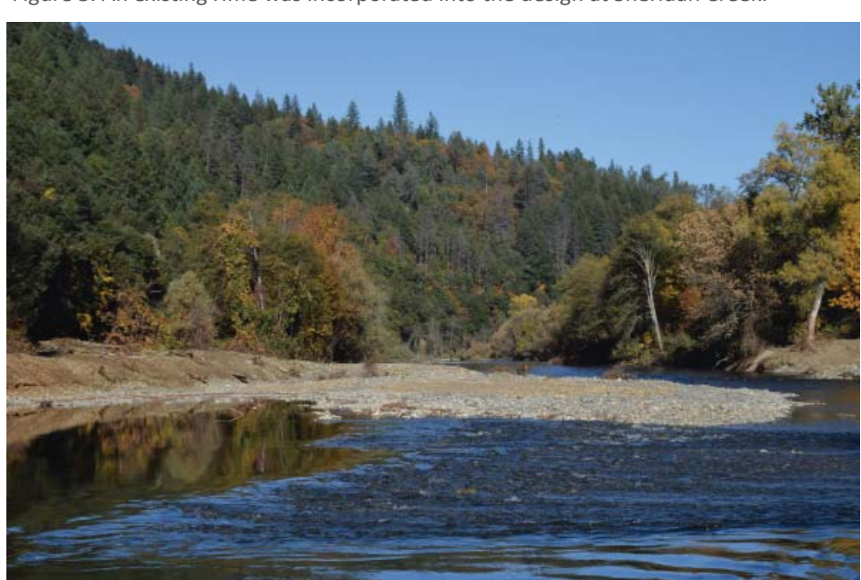
Figure 3. An existing riffle was incorporated into the design at Sheridan Creek.

Please visit www.trrp.net for more information, technical reports, other products, and links to partner and cooperator information.