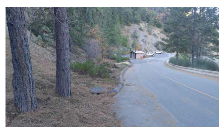
Before and after photos of Spanish Broom removal at the Fairview Boat Ramp.