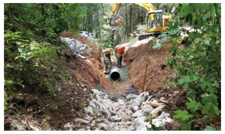
Democrat Gulch Road work.

The District continued to expand its implementation and monitoring efforts on revegetation and restoration projects for Caltrans on various sites in Trinity County such as the Slate Creek slide on Highway 3 north of Weaverville, and the Collins Bar curve improvement along Highway 299 west of Big Bar. We will also be entering an agreement with Caltrans to continue this work on the Big French slide on Highway 299 west of Junction City in the near future.