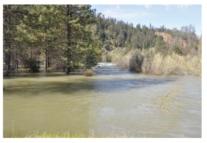
Figure 2. Restoration flows near the Bucktail boat access area when approximately 11,000 cfs was released from Lewiston Dam in May 2017.

river's ability to naturally recover from logging and mining compounded the initial impacts from these activities.